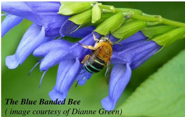
The Blue Banded Bee

Thank you to everyone who took the time and effort to submit an entry. The Dugongs and all their cousins thank you. Keep your eye out for a compilation of all the entries. The link will be posted on the MRCCC’s website at www.mrccc.org.au .