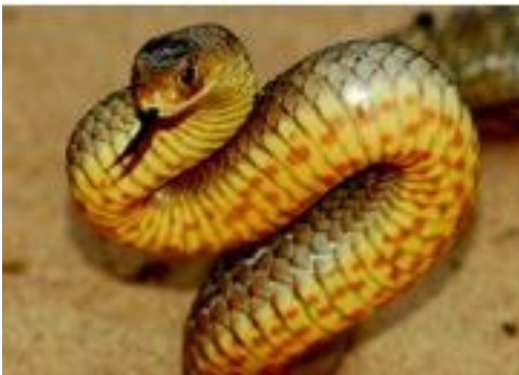
The Eastern Brown Snake – one of the world's most venomous snakes – is not always brown!