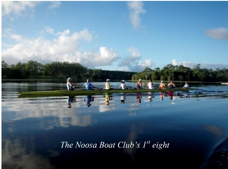
The Noosa Boat Club's 1 st eight

Mornings on Lake Macdonald have been glorious recently. Prior to sunrise the planets of Jupiter, Mars, Venus and the infrequently seen Mercury have been visible in the east north east, and after sunrise the hugely varied bird life of the area comes to life. It is quite a distraction from the rowing activities of the Noosa Boat Club to watch the Sea Eagles, Black Cockatoos, Black Swans, Magpie Geese and many others in the early morning.