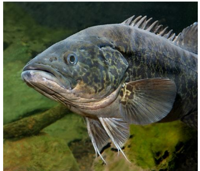
The endangered Mary River Cod, a top order predator of the Mary Catchment

If you think the Splatter Gun could help you get on top of your lantana problem and would like to borrow one of the MRCCC kits please contact Dale Watson on 07 5482 4766. In conjunction with the loan of the Splatter Gun, the MRCCC is offering landholders the opportunity to develop a lantana management plan for their property. Landholders who have already completed these plans agree that the plan has given them a much clearer and targeted view of their weed control activities.