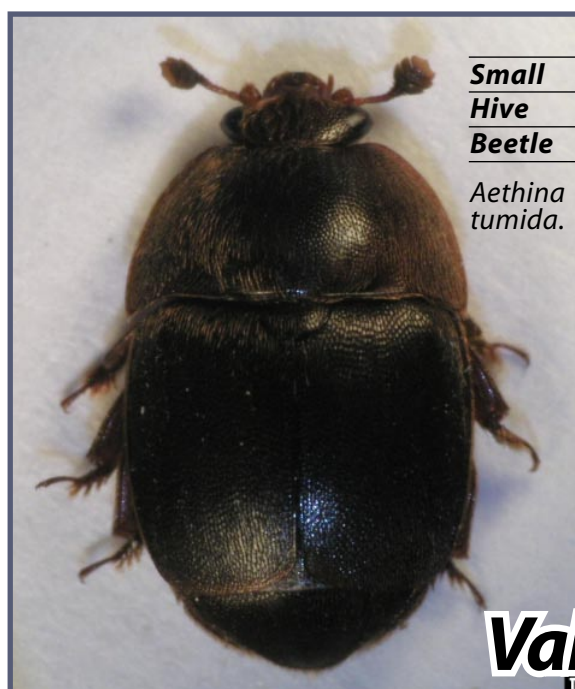
Small Hive Beetle Aethina tumida.